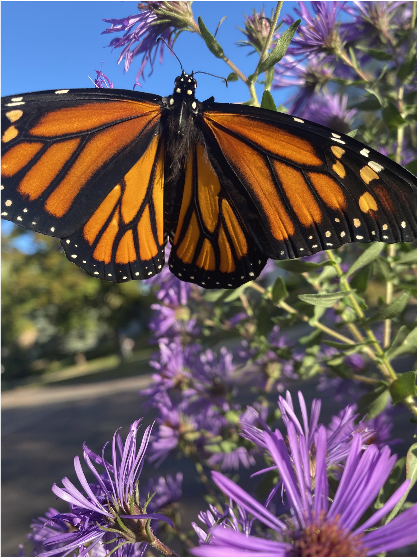
Our Saviour's Lutheran Church October 2023